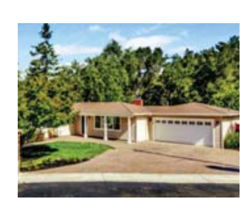
11 Moraga Court, Orinda 5 Bed | 3.5 Bath | 2,375 Sq Ft | $1,767,000 Represented Buyers