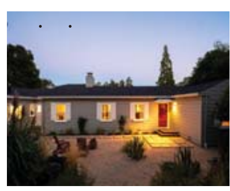
3567 Boyer Circle, Lafayette 4 Bed | 3 Bath | 2,323 Sq Ft | $1,725,000 Reresented Buyers

Kristi Ives 925.788.8345 kristi@brydonivesteam.com DRE 01367466