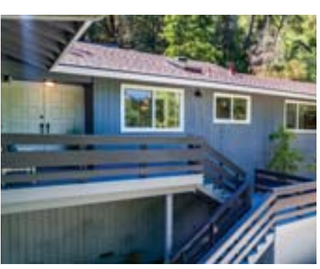
3417 Goyak Drive, Lafayette 4 Bed | 2 Bath | 2,071 Sq Ft | $1,275,000 Represented Seller