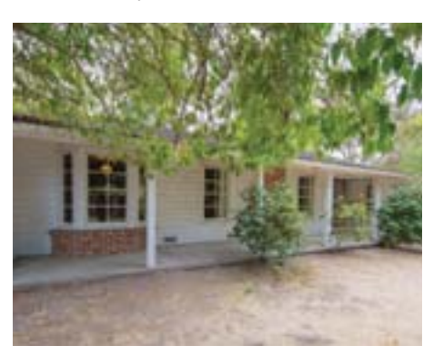
3015 Diablo View Road, Lafayette 3 Bed | 1 Bath | 1,508 Sq Ft | $814,000 Represented Buyers